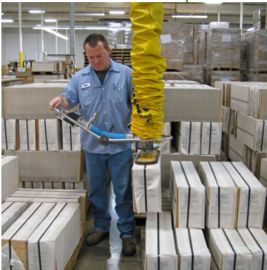
After engineering controls