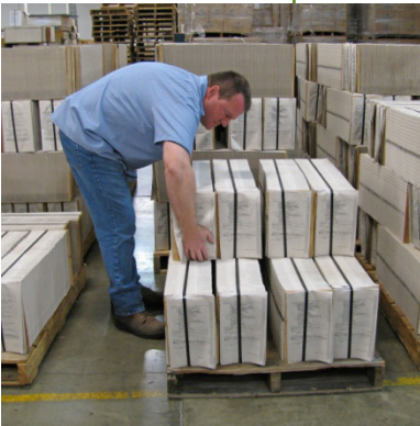
Before engineering controls

Practical examples of controlling hazards with engineering controls, administrative controls, or personal protective equipment (PPE)