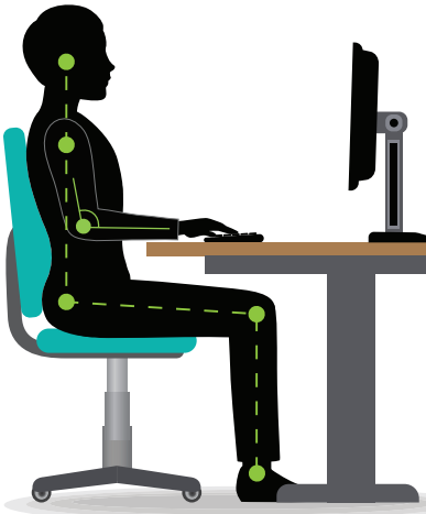
Correct - Wrists straight

To set up a workstation that fits your needs, it's helpful to understand the concept of neutral body posture. Neutral body posture is a comfortable working position in which your joints are naturally aligned. Working with the body in a neutral position reduces stress and strain on the muscles, tendons, nerves, and joints - which can reduce your risk of developing a musculoskeletal disorder (MSD). After watching the Office Ergonomics: simple solutions video series, use this checklist to review key areas of your workstation. Discuss your completed worksheet with your supervisor or manager to determine the best solutions for your workplace.