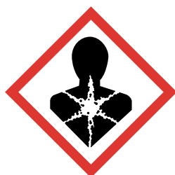
Hazardous to health