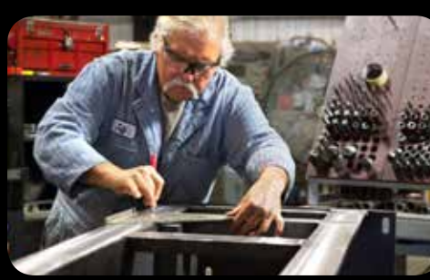
Con-Vey Keystone | ROSEBURG