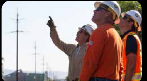
Oregon Trail Electric | BAKER CITY