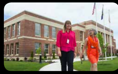
Redmond City Hall | REDMOND