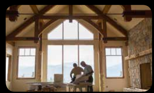
Bostwick Construction & Millwork | MEDFORD