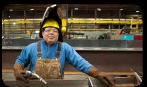
Fought & Company, REFA Erection | TIGARD