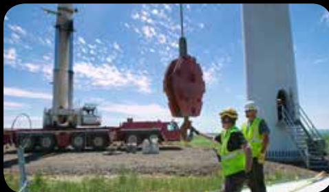
NW Crane Service | HERMISTON