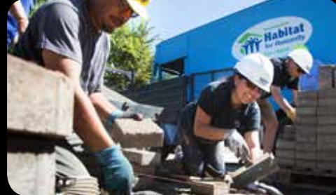
Habitat for Humanity | NEWBERG