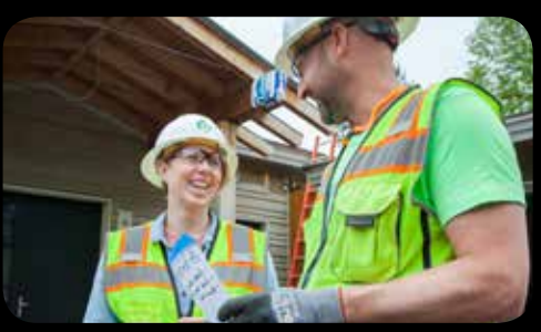
Green Hammer | PORTLAND AND ASHLAND