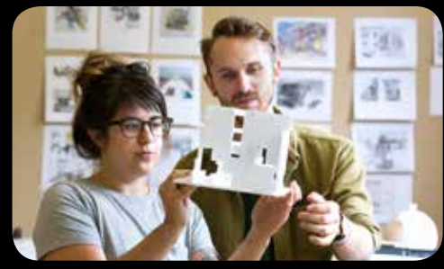
Portland State University School of Architecture | PORTLAND