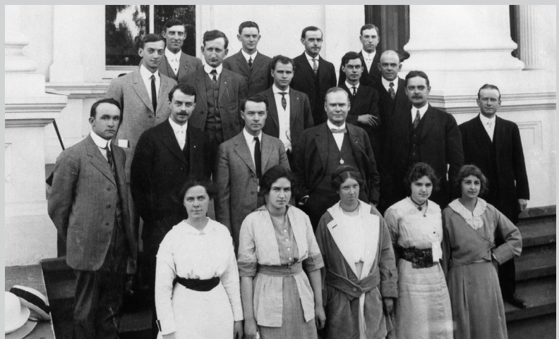
The first employees of the State Industrial Accident Commission.

To learn more about the SAIF story and our role in shaping and leading workers' compensation reform in Oregon, visit saif.com .