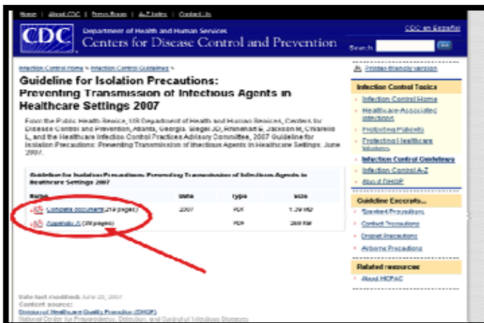
Figure 1. The Guideline for Isolation Precautions document is posted on the CDC website. Appendix A is provided as a stand-alone excerpt (circled).

The CDC also has published the entire isolation guideline on its website. The matrix of infectious diseases and their precautions are contained within Appendix A of the lengthy guideline, but Appendix A has also been posted as a stand-alone document for convenience of use. See Figure 1.